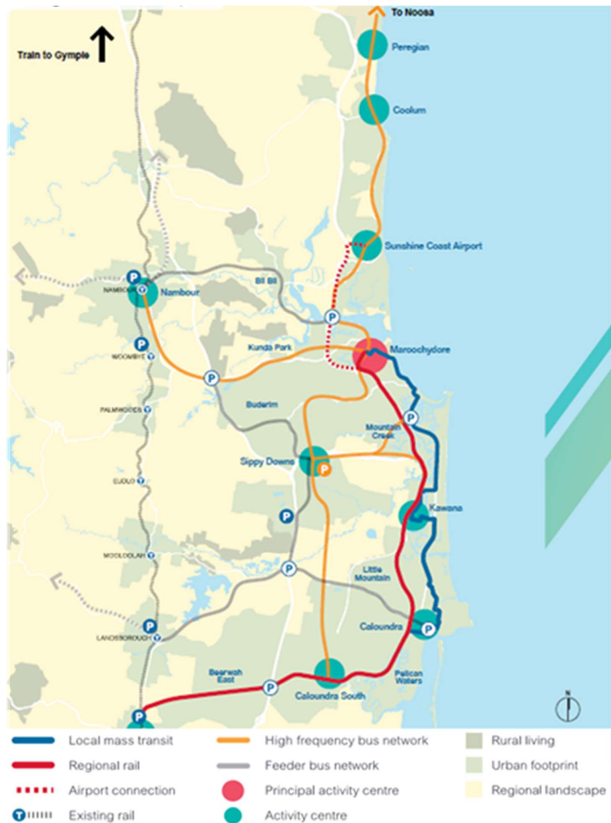
Figure 1 Mass Transit Master Plan

In considering this master plan, it is important to bear in mind that around 77 percent of Sunshine Coast residents who are employed have a job on the Sunshine Coast and only 5 percent have a job that's located in Brisbane. It therefore makes sense to service this high number of local employees with quality public transport.